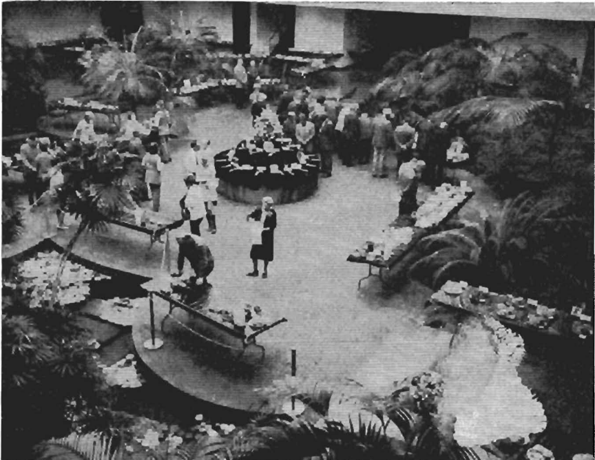
A balcony affords a beautiful view of the sunken garden area from all sides of the building.